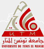
University of Tunis (Tunisia)