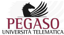
Pegaso University (Slovenia)