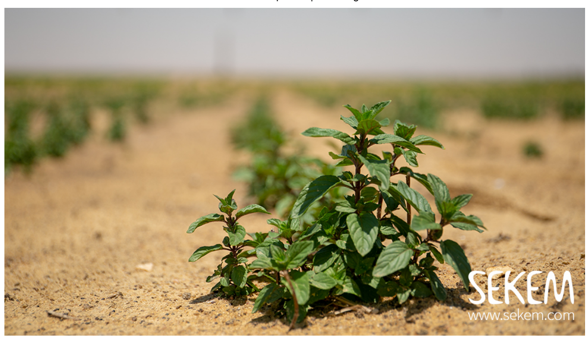
Update #3 by Narimeh Paeplow | Jul 11, 2019 | Updates