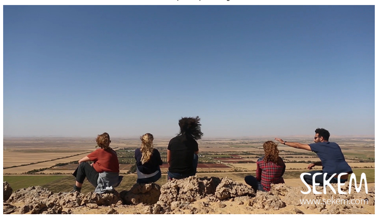
Update #7 by Narimeh Paeplow | Jan 23, 2020 | Uncategorized