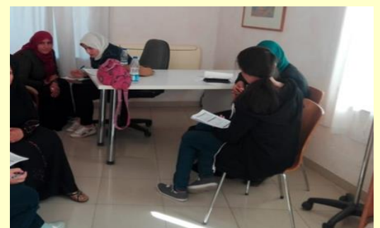
HU students conducting interviews in the 13 villages client at SEKEM medical center - 16 th Nov 2019