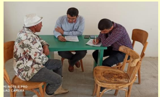
Conducting one of the interviews in the 13 villages office at SEKEM Farm - 7th of November 2019