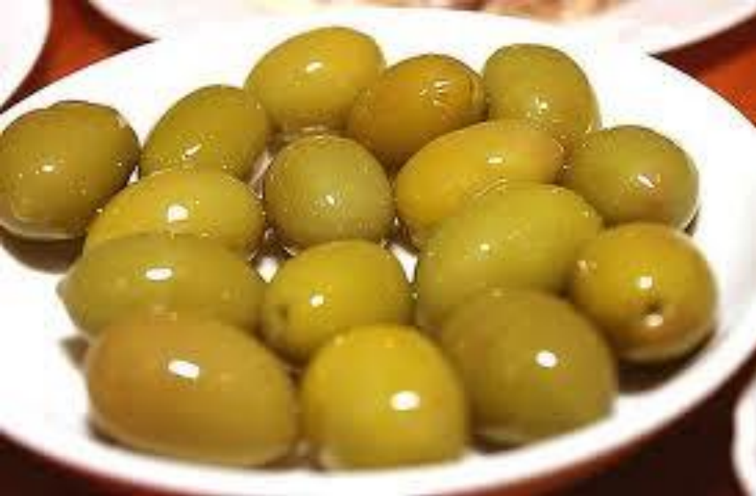
Toffahi – table olive