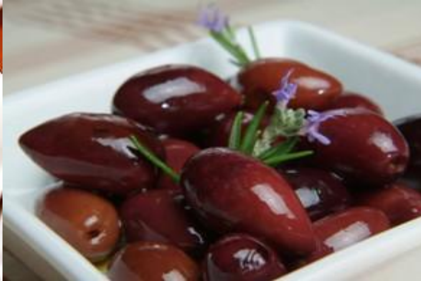
Kalamata – table olive