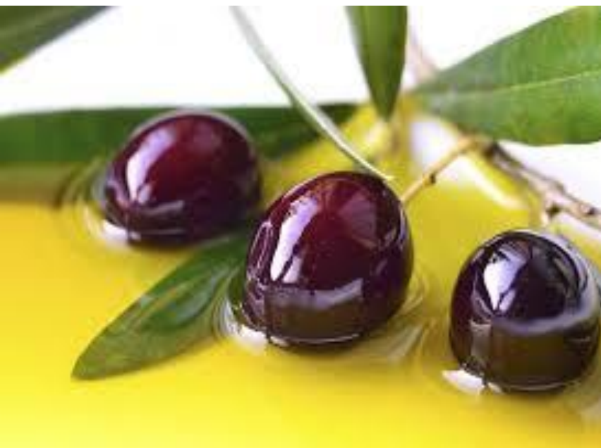
Manzanillo – table & oil