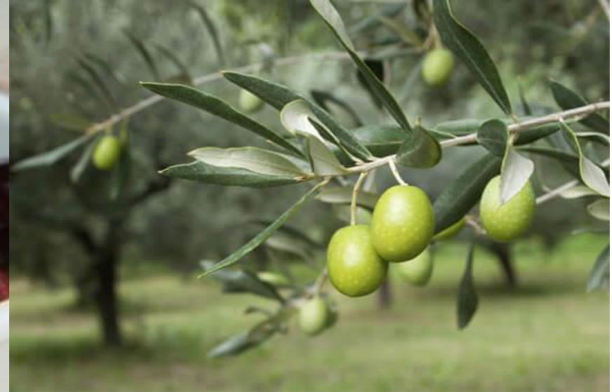
Koroniki – Oil cultivar