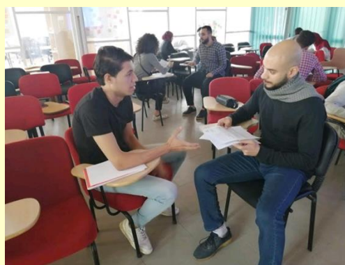
HU Students during the role play for the questionnaire