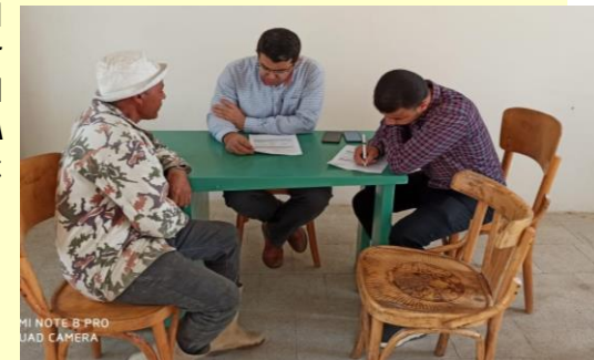
Conducting one of the interviews in the 13 villages office at SEKEM Farm - 7 th of November 2019

“ We are really looking forward to this project and to participate in the activities and actions that will take place in all villages ” Stated by one of the employees of SEKEM