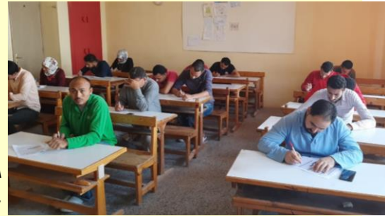
18 Employees Filled out the questionnaire by themselves in SEKEM schools Classes

As part of the questionnaire development, 18 employees from SEKEM companies who are living in the 13 villages were invited to SEKEM School to fill out the questionnaire. Most of them can read, write and able to fill out the questionnaire by themselves. This process was followed by discussion with them on the clarity of the questionnaire and if they faced any problems while they were filling it out. Many notes were taken and the team writes it down for more fin-tuning of the questionnaire. For those who cannot read and write, the team did interviews with them and their notes were registered as well. More than 600 employees of SEKEM companies came from the 13 villages and they were very enthusiastic when the team introduced the project for them.