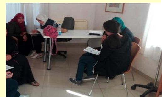
HU students conducting interviews in the 13 villages client at SEKEM medical center - 16 th Nov 2019